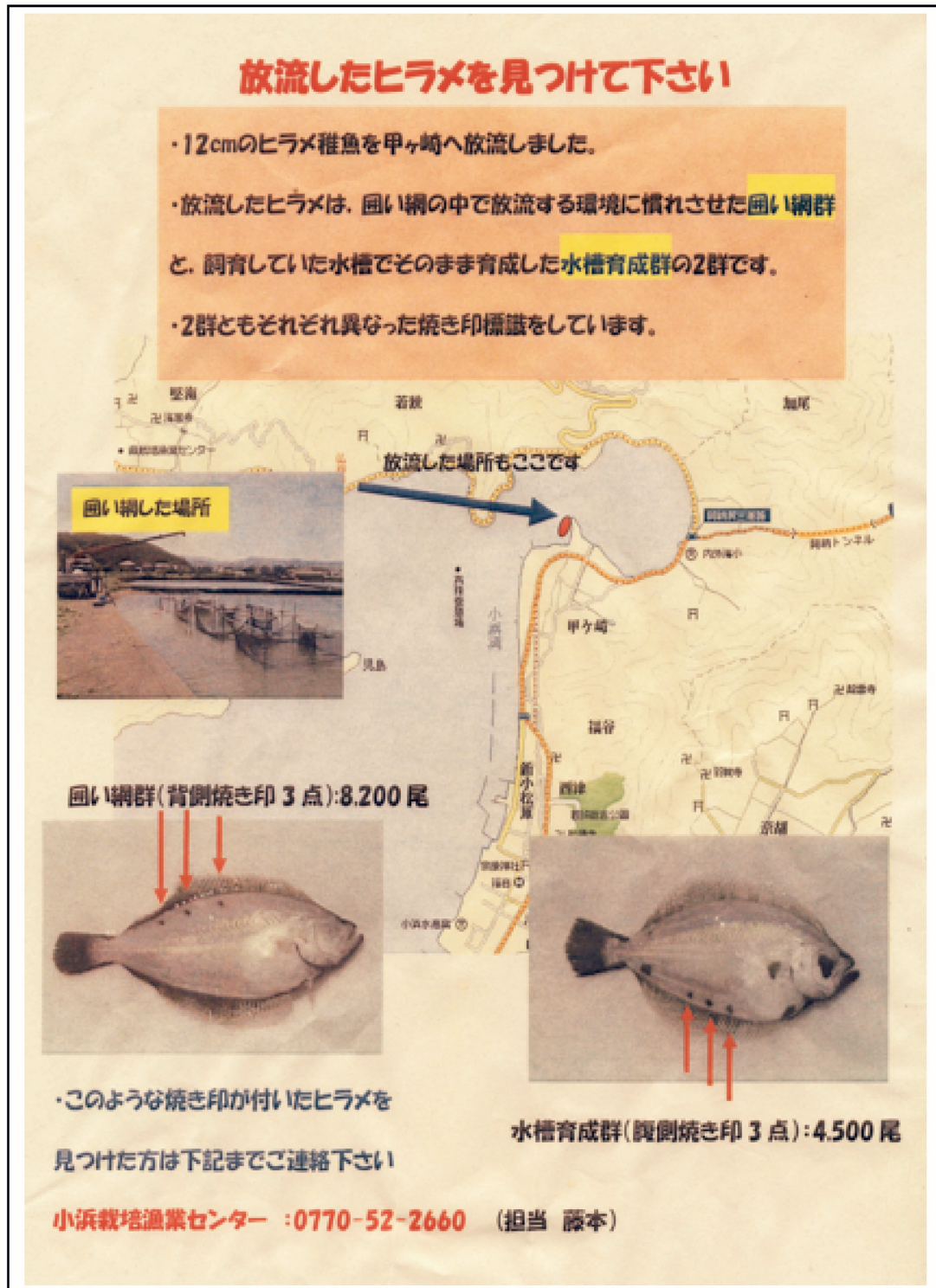
Fig. 1. Poster distributed to recreational fishermen in eastern Obama Bay. Note the series of marks denoting conditioned (dorsal) and non-conditioned (ventral).

stocked fish. Condition status was determined using two methods: (1) a series of burn marks or brands inflicted on each fish's blind side (Fig. 1), and (2) by soaking fish en masse in an alizarin complexone