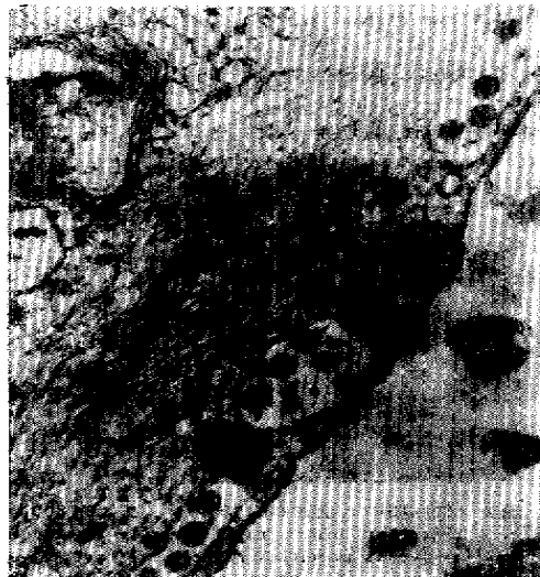
Fig. 3. Smallpox: the matured viral grains are released to the superficial areas through follicles (x 13000).